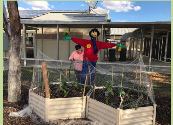
My new friend at Bedourie SS